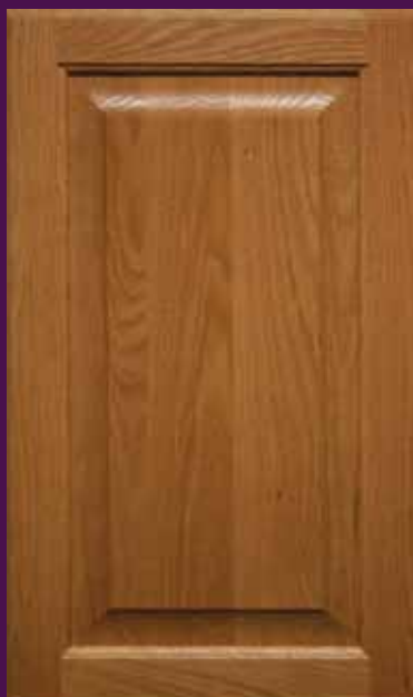
Manchester Oak Raised Panel