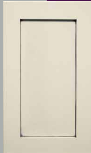
Chiffon Maple Mission Flat Panel