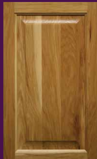
Hickory Raised Panel