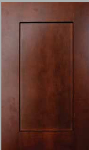
Sienna Maple Mission Flat Panel