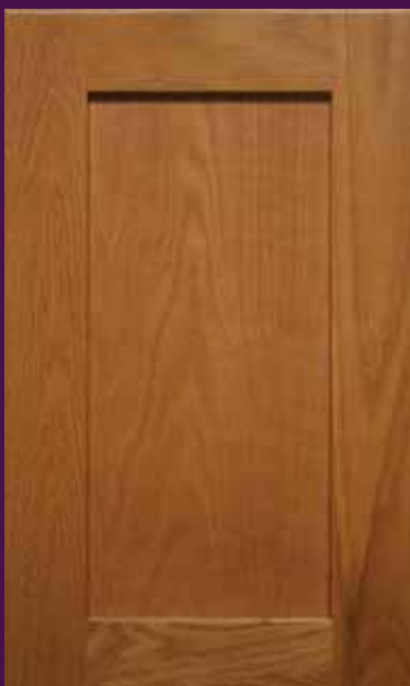
Manchester Oak Mission Flat Panel

Classic Craft Cabinetry endure a series of rigorous test, measuring structural integrity. Cabinet doors, drawers and even the finish is tested before earning the KCMA Cabinet Certification.