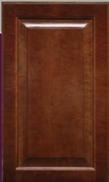
Sienna Maple Raised Panel